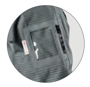
Pocket for ID card on the right sleeve.