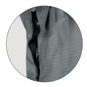
Openable ventilation in the armpits.