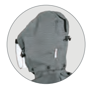
Detachable hood with three adjustment possibilities and room for head protection.