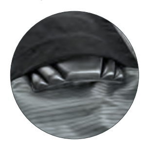
Reinforcements on the knees / pockets for knee pads.

Thoughtful details are often the difference between good and excellence. We know that by working closely with the users.